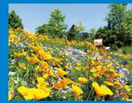
Wisteria Hill in Garden Museum Hiei