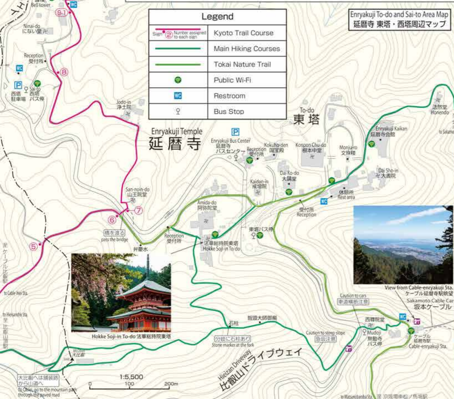
Enryakuji To-do and Sai-to Area Map 延暦寺 東塔・西塔周辺マップ