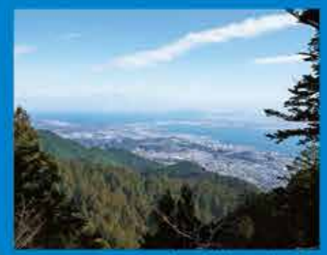
View from Cable-enryakuji Sta.