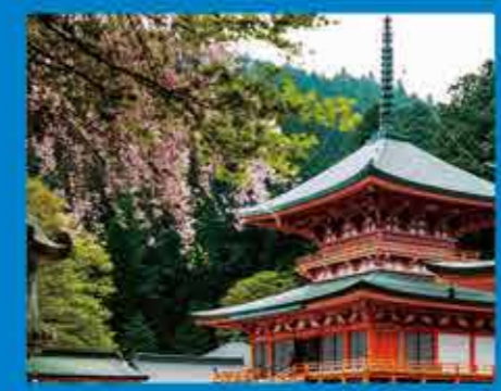
Hokke Soji-in To-do