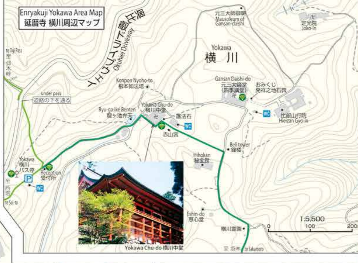
Enryakuji Yokawa Area Map 延暦寺 横川周辺マップ

Visitors are charmed by the twittering of wild birds in spring and soothed by its clean air, which is cooler than that in the plain below, in summer, when the foliage is a brilliant green. Autumn turns the maple leaves scarlet over the whole mountain, and is followed by the tranquility of winter, which wraps it in pure white snow. It therefore presents a different aspect that will surely delight the senses in any season.